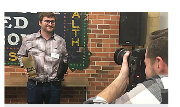
Industrial hemp: North Carolina poises to exploit an old new crop