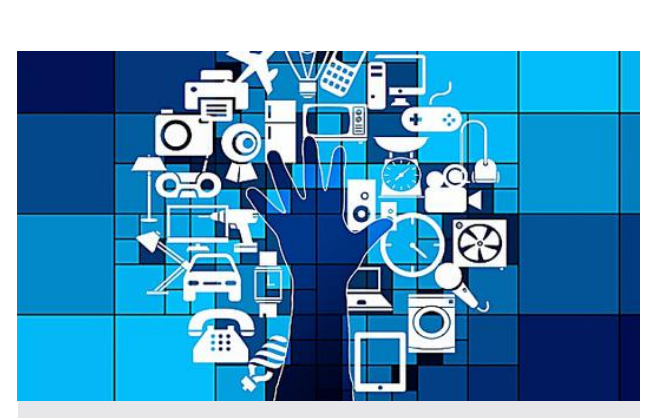
Windstream sells EarthLink consumer internet business for...