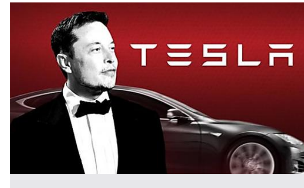
Two added to Telsa board as part of SEC settlement