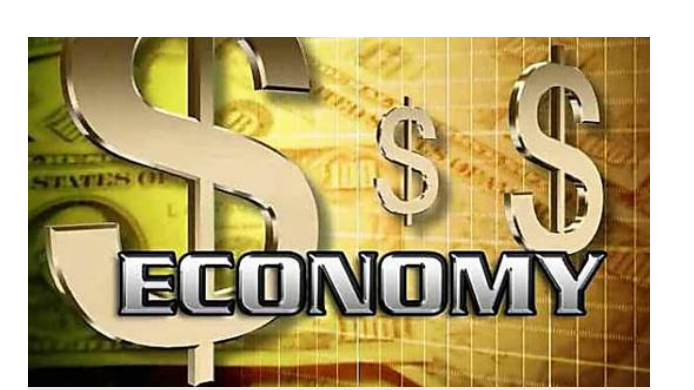
Mike Walden: Is recession coming in 2019 for US economy?