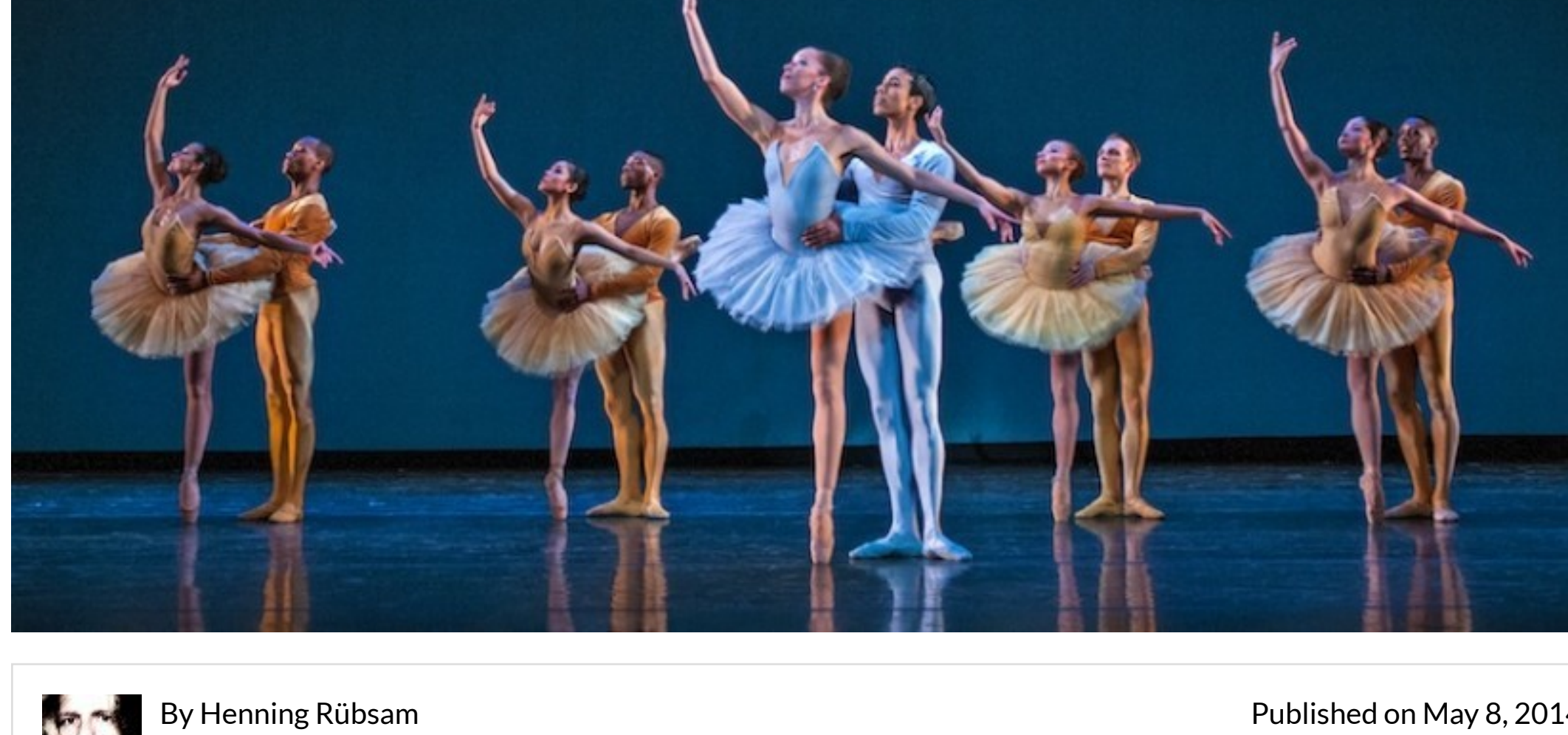
Published on May 8, 2014